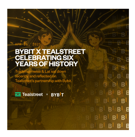
Bybit x Tealstreet Celebrating Six Years of History